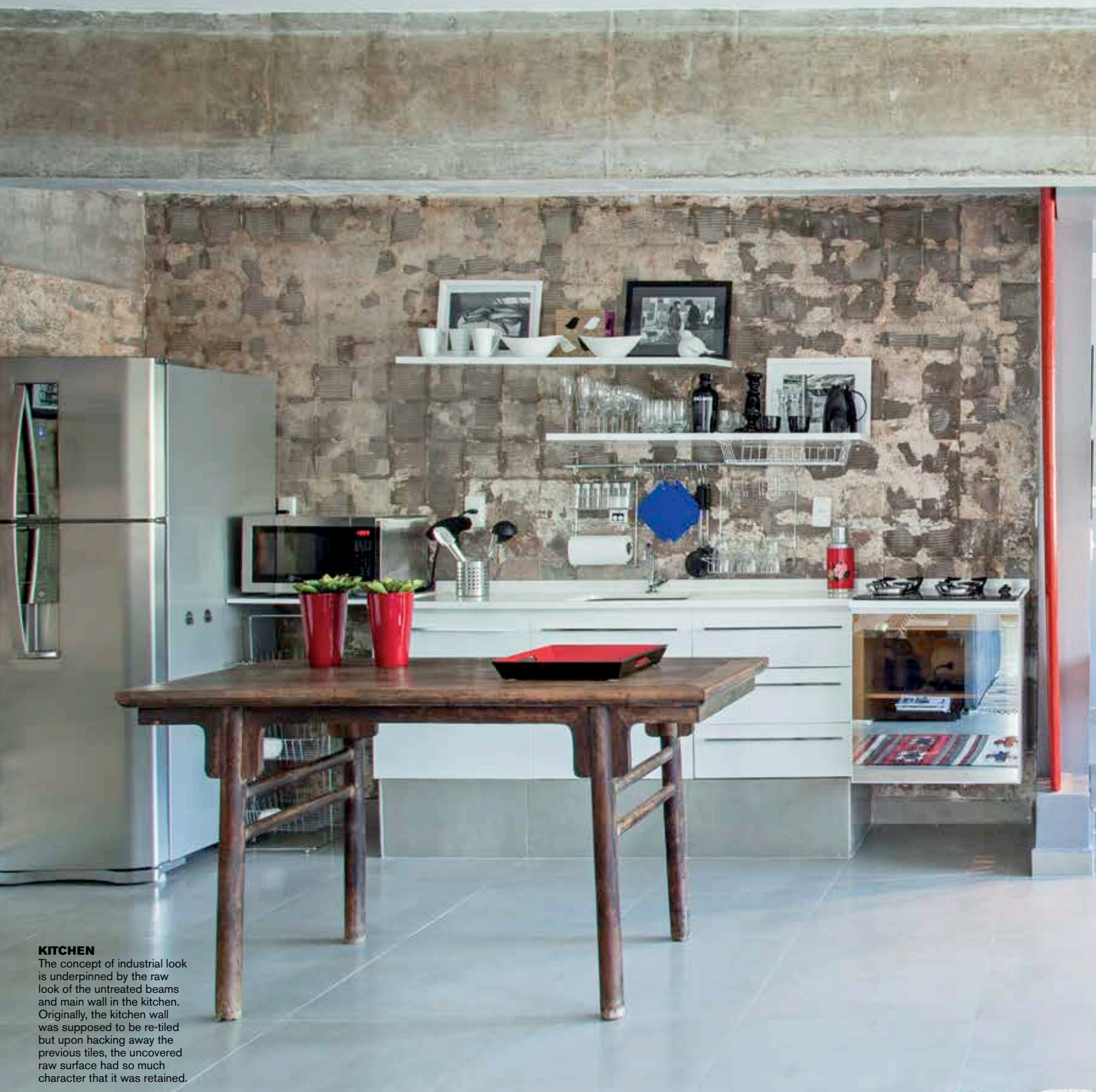
KITCHEN The concept of industrial look is underpinned by the raw look of the untreated beams and main wall in the kitchen. Originally, the kitchen wall was supposed to be re-tiled but upon hacking away the previous tiles, the uncovered raw surface had so much character that it was retained.